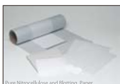
Pure Nitrocellulose and Blotting Paper